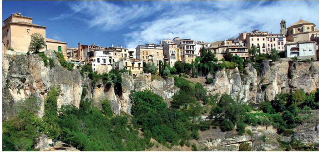
Hanging houses of Cuenca