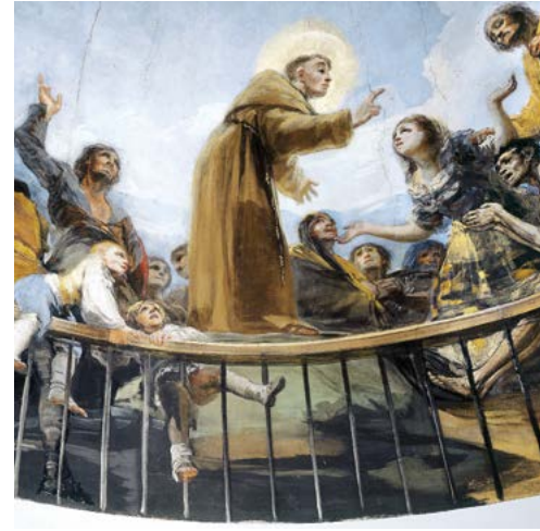
Fresco detail Church of San Antonio de la Florida, Madrid