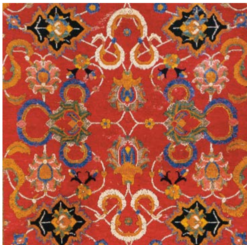
'Vine Scroll' Carpet, Iran, 17th century, Museu Nacional de Arte Antiga

There is some opportunity for independent exploration at your leisure, with free time in various locations scheduled.