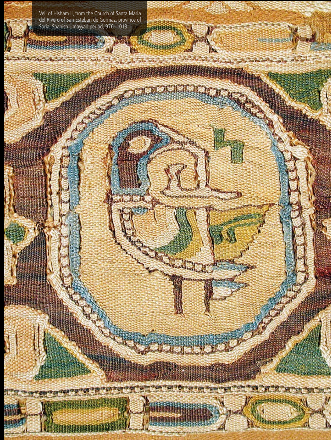
Veil of Hisham II, from the Church of Santa Maria del Rivero of San Esteban de Gormaz, province of Soria, Spanish Umayyad period, 976–1013