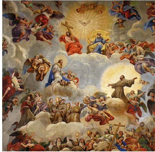
Frescoes in the church at Monasterio de las Descalzas Reales

Dinner takes the form of a tapas walk, with the option to attend a flamenco show