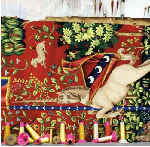
Tapestry on the loom at the Royal Tapestry Factory