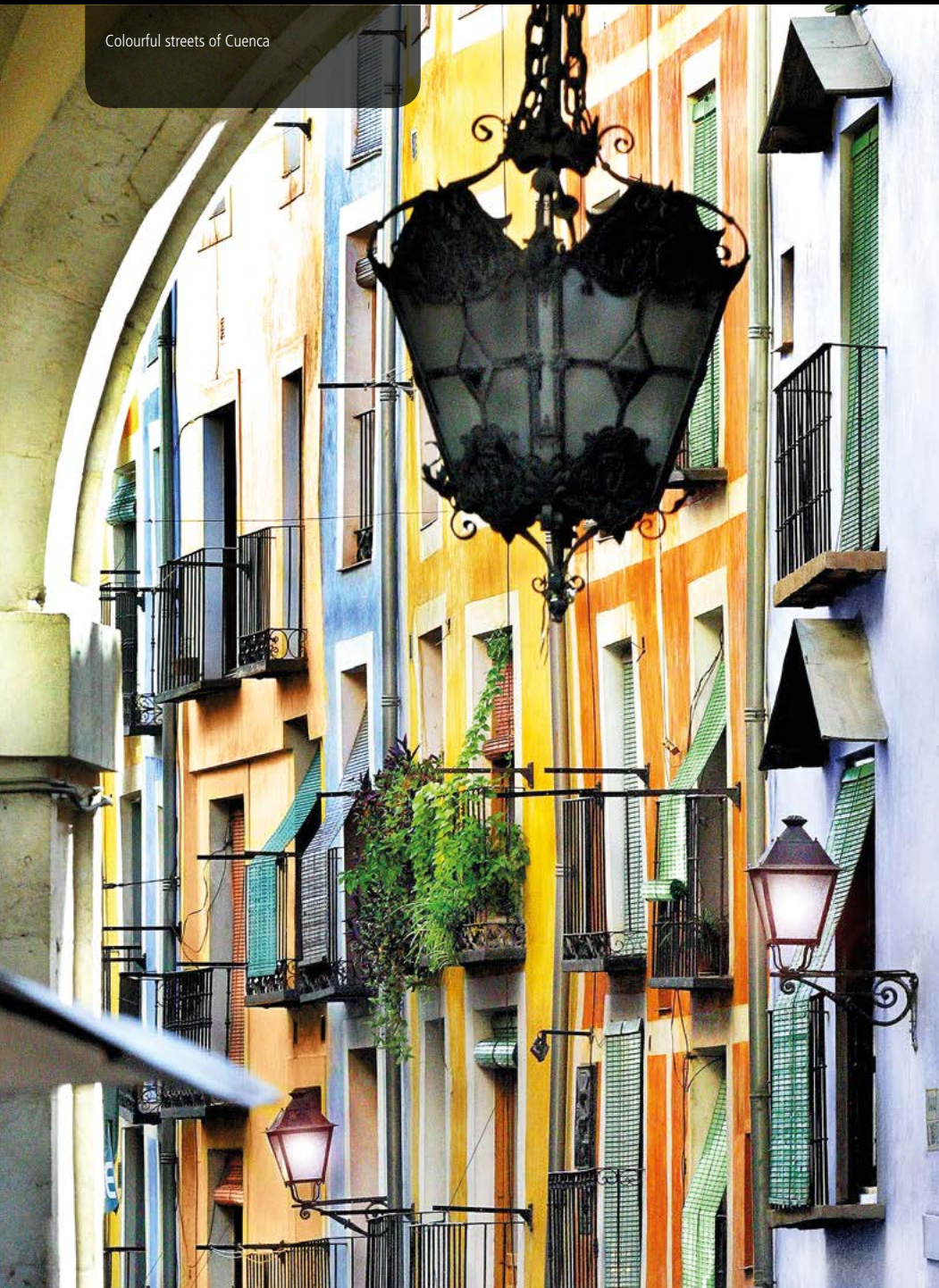
Colourful streets of Cuenca