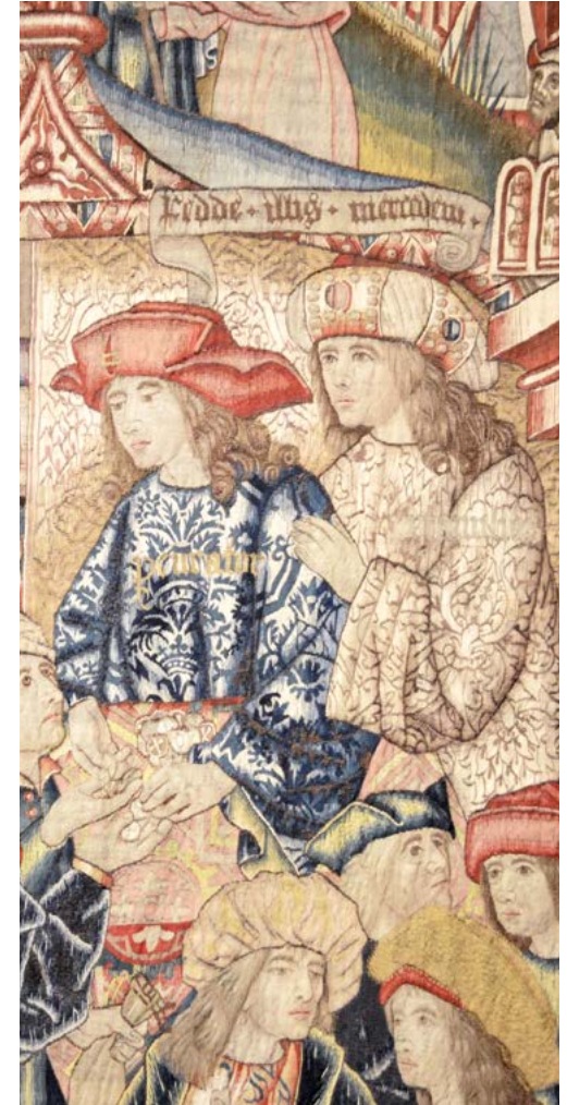
Renaissance tapestry (detail)

Cathedral: the Gothic cathedral is Spain's largest and the most richly endowed with paintings (El Greco, Velázquez, Titian) and a large collection of tapestries from Europe.