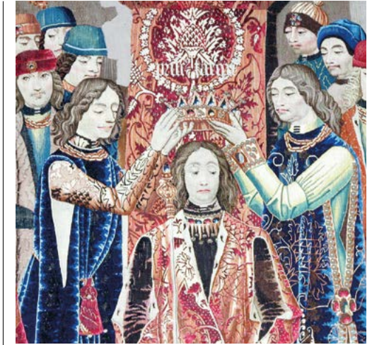
Tarquino Prisco tapestry (detail), Zamora Cathedral