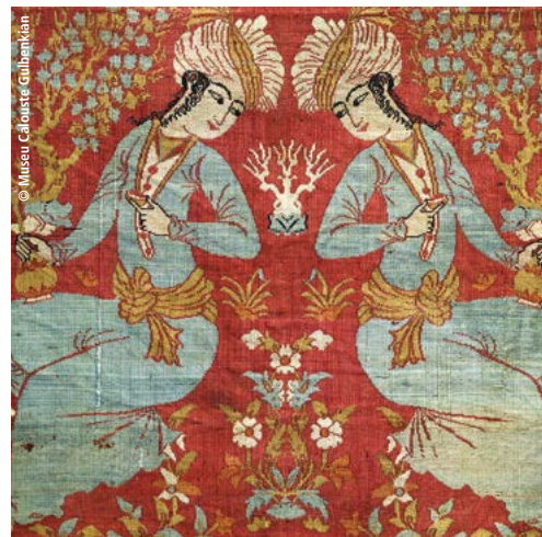
Silk fragment, Kashan, 17th century, Museu Calouste Gulbenkian