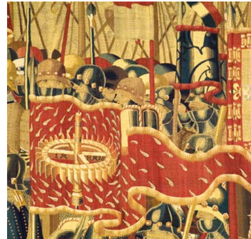
The Conquest of Arzila and Tangier (detail), Collegiate Church of Nuestra Señora de la Asunción de Pastrana, Guadalajara

Return to Madrid for an independent dinner