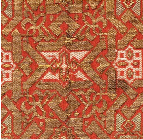
Nasrid textile fragment, inv. 1606, Museo Lázaro Galdiano, Madrid