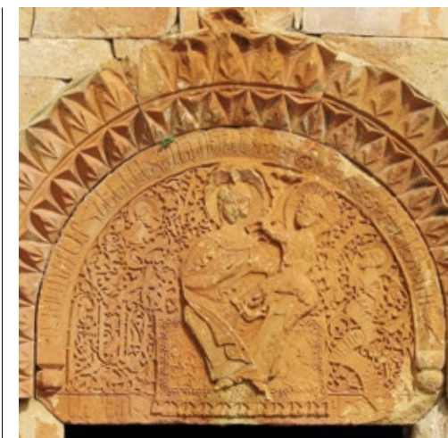
13th century tympanum above the door to St. Karapet church, Noravank

Enjoy a warm reception from the family-run Armenian carpet company.