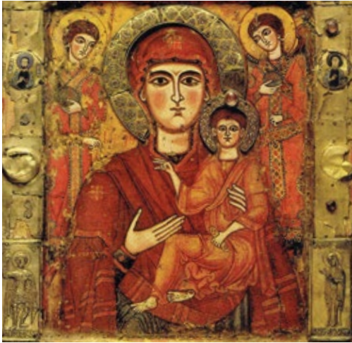
Christian virgin and child icon, Treasury of the Museum of Fine Arts, Georgia