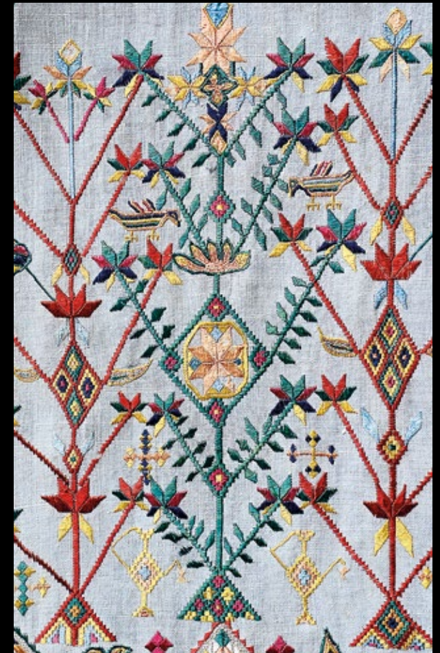
Armenian embroidered towel, Hovannes Sharambeyan Museum of Folk Art