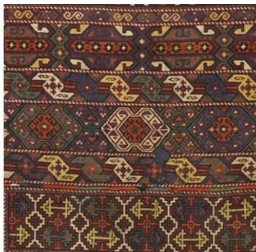
Armenian woman's apron, Hark, 18th century, History Museum of Armenia

There is some opportunity for independent exploration at your leisure, with free time scheduled in various locations.