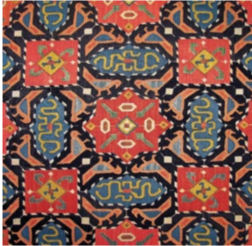
Contemporary Armenian embroidery