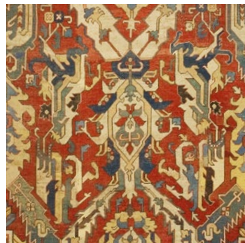
Dragon carpet (detail), 17th century, Museum of Sardarapat