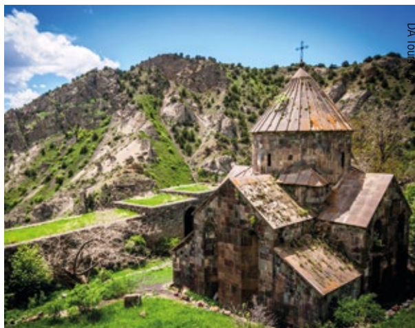
Gndevank Monastery, 10th–13th century

A gentle, spiritual atmosphere is tangible in the landscapes and buildings of Armenia, whose skyline is dominated by the dramatic Mount Ararat. The region is integral to the history of rugs and textiles, both in terms of production and trade. 2015 is an important year for the Armenian nation, with memorial services capturing the world's attention.